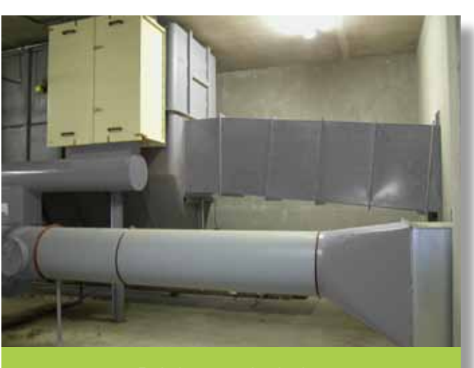
Explosion vent and outlet duct